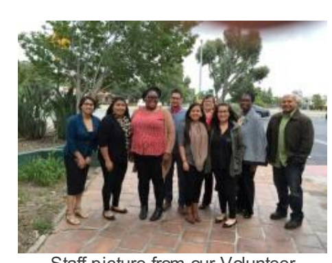
Staff picture from our Volunteer Appreciation Luncheon 2016